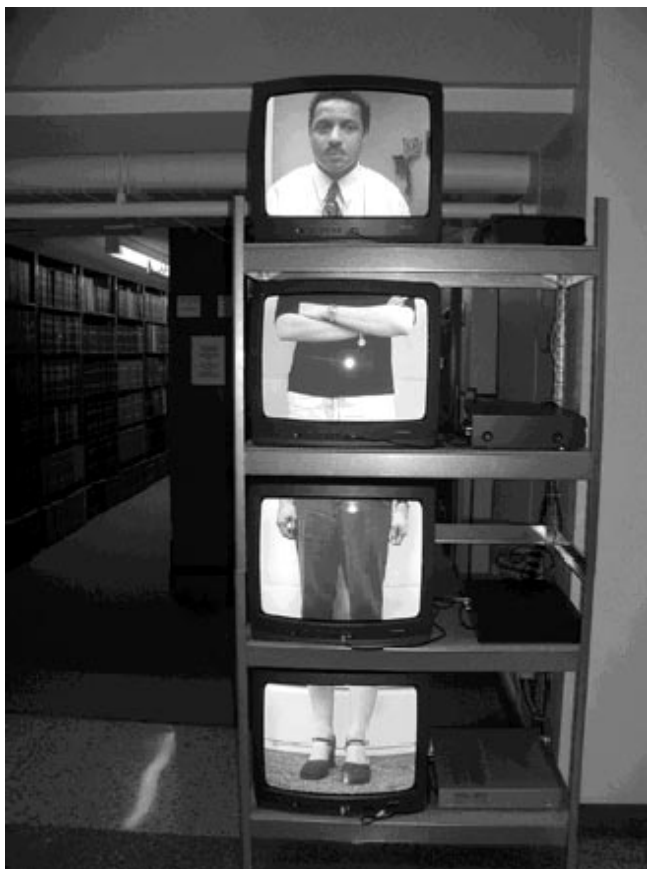
One of the many video scenes in the compelling evidence exhibit in the Galter Library's atrium.