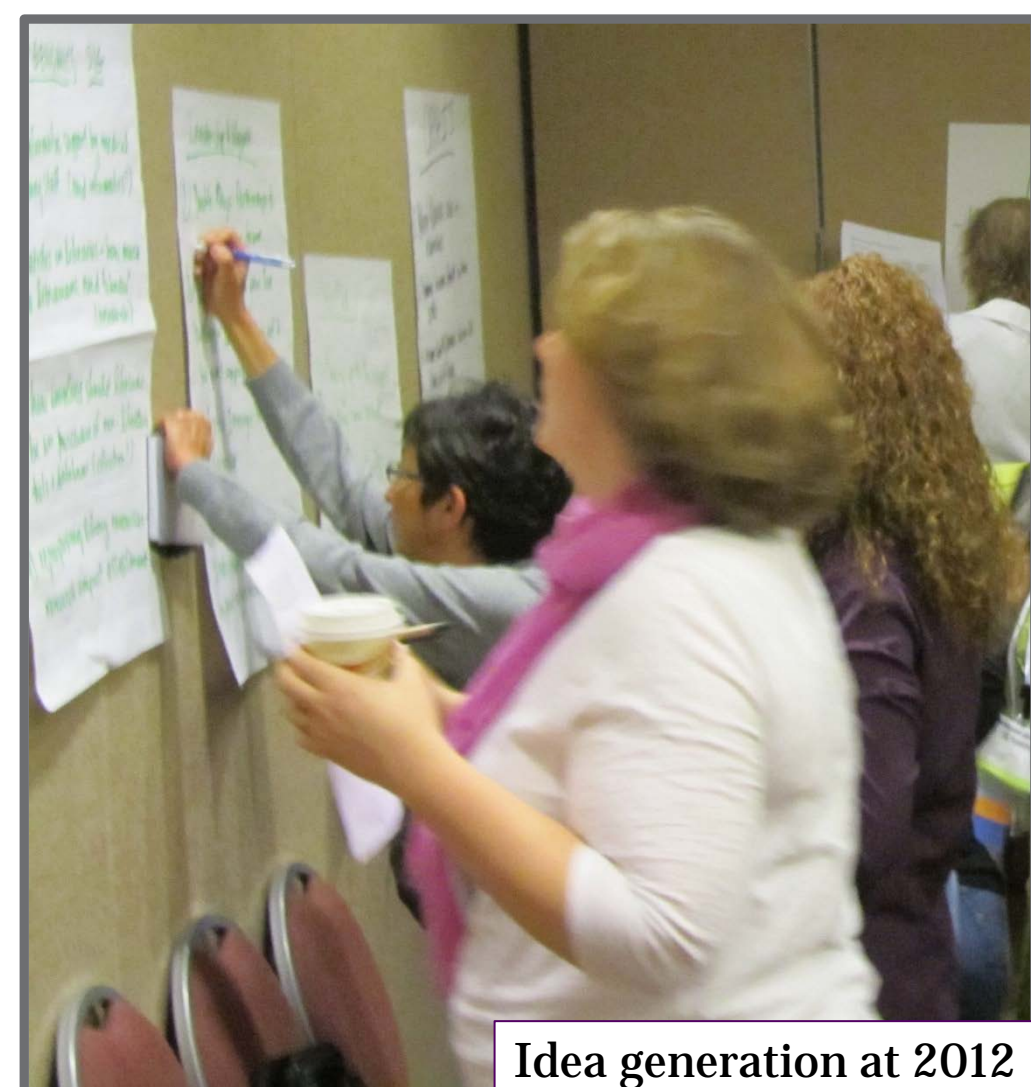
Idea generation at 2012 planning meeting

2 Section Council Webmaster / Learning Resource Center, Mayo Clinic Libraries, Mayo Clinic, Rochester MN