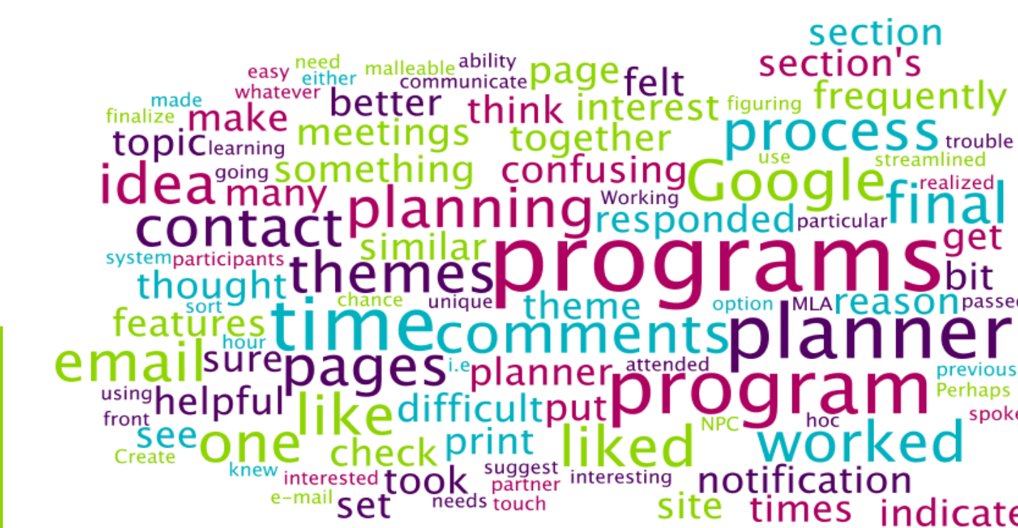
Word cloud of survey responses to question, "What didn't work?"