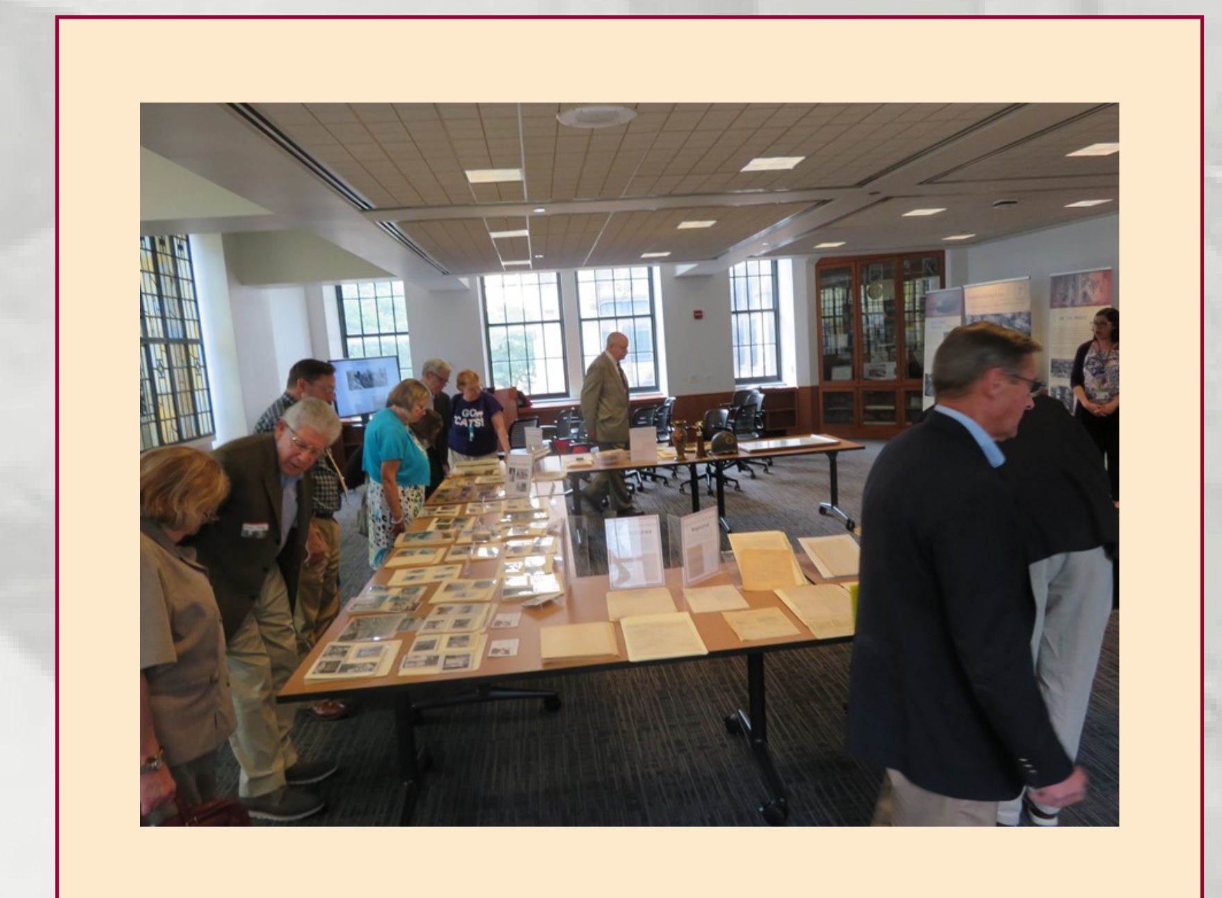
Sharing materials with event attendees at an open house