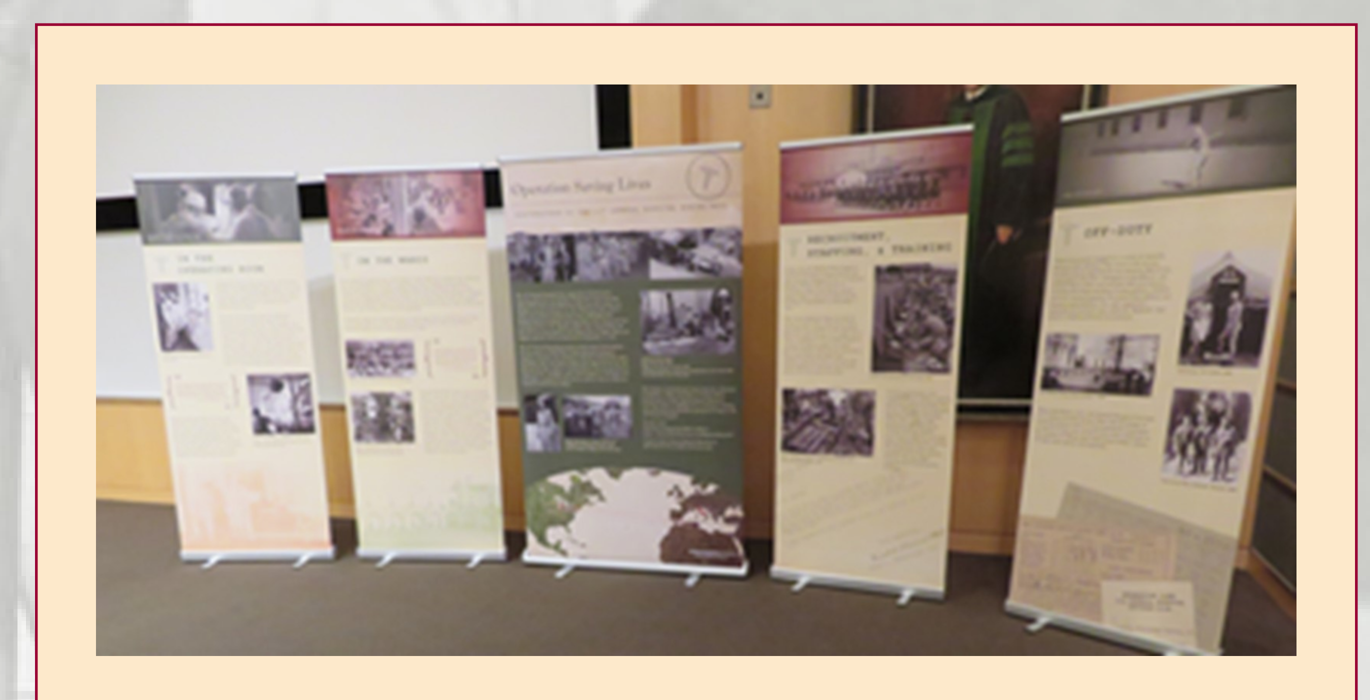
Banner exhibit, documenting the medical and military pursuits of the 12 th General Hospital Unit, were created in PowerPoint and transferred to VistaPrint. These banners are on display in the library have been shown at other institutions.