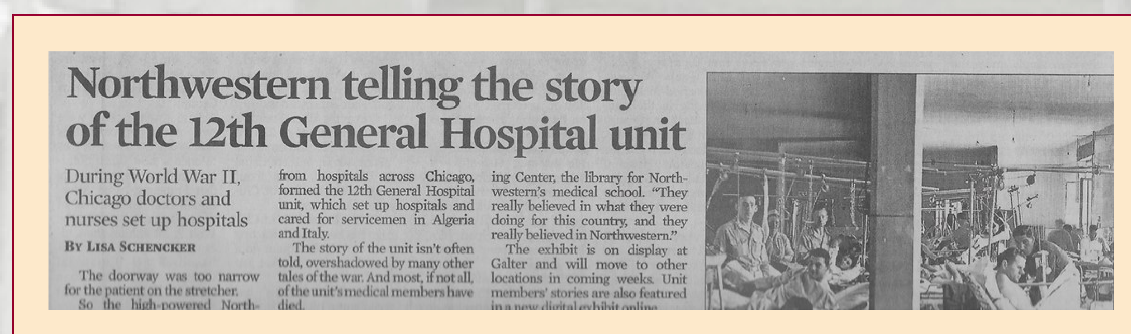
Coverage of the event in the Chicago Tribune