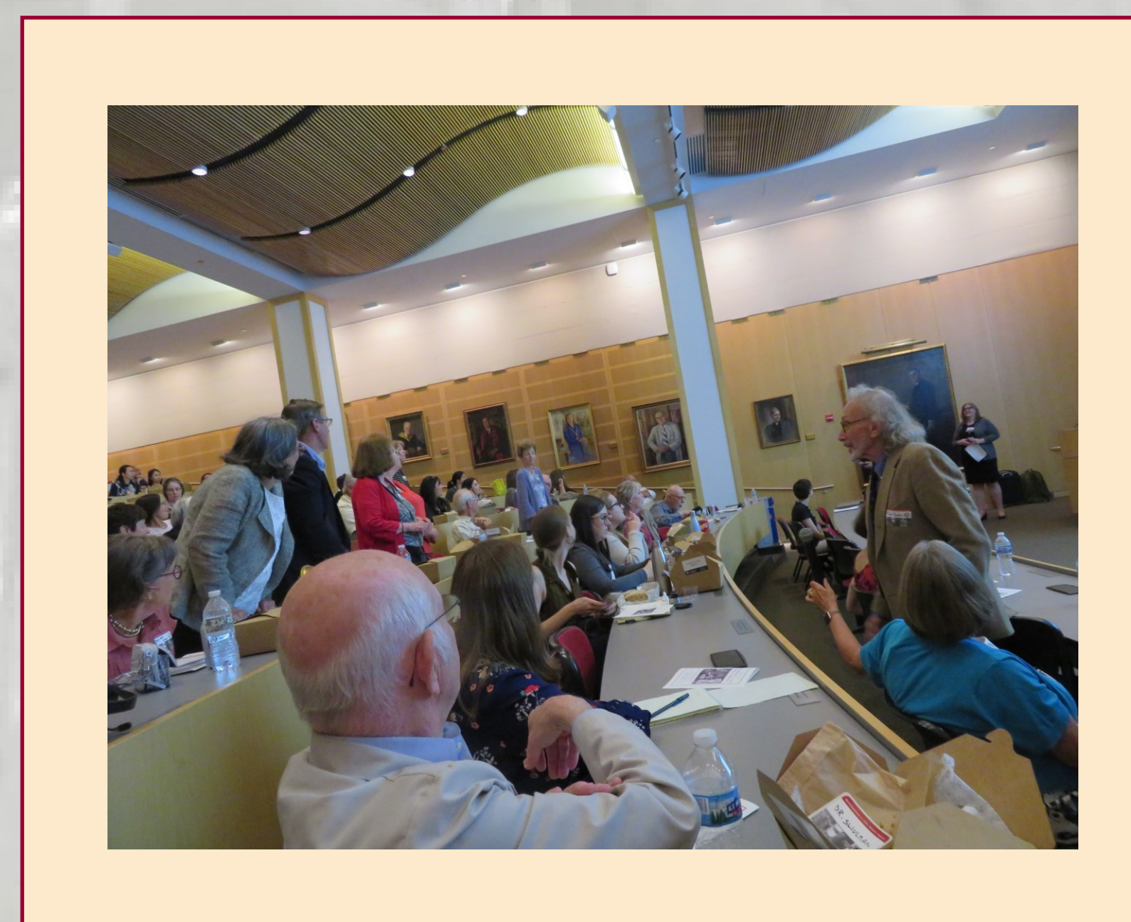
Family of 12th General Hospital Unit members recollect about their loved one's experiences