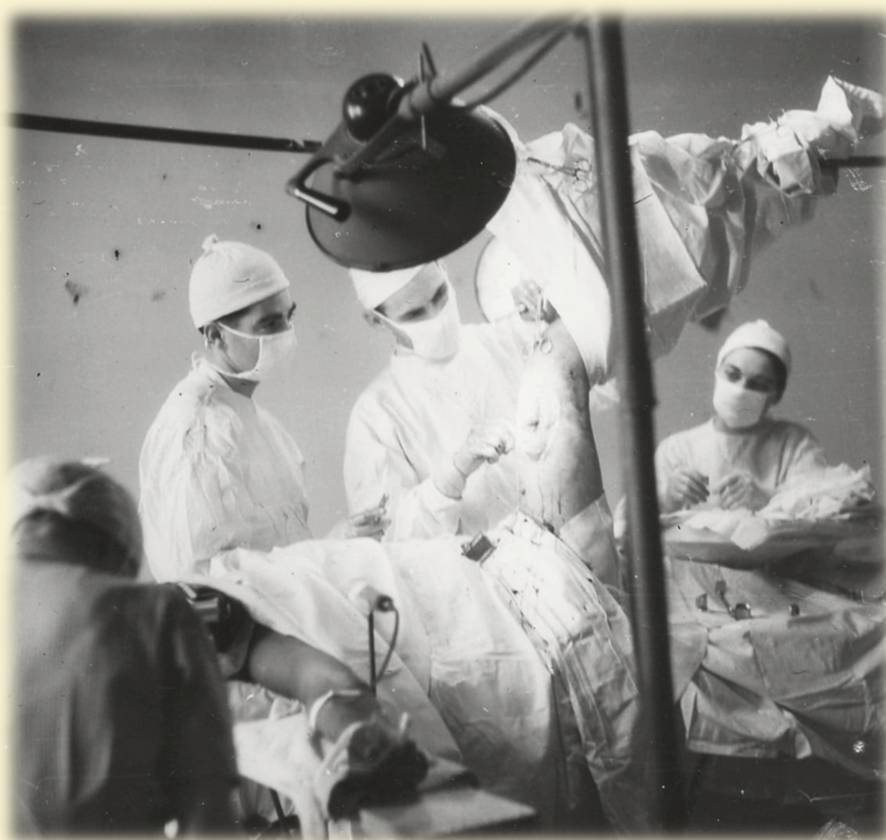
Above: Performing a leg operation, Rome 1944 Below: Central corridor with operating rooms on left and right, Rome 1944

Surgeons spent less than two hours per operation in order to treat more patients. Easier cases were often treated first because those patients could potentially return to the front lines. In Rome and Leghorn, 12th General Hospital personnel often performed more than 100 operations a day – attending to both injuries inflicted by war and routine conditions like hemorrhoids and hernias.